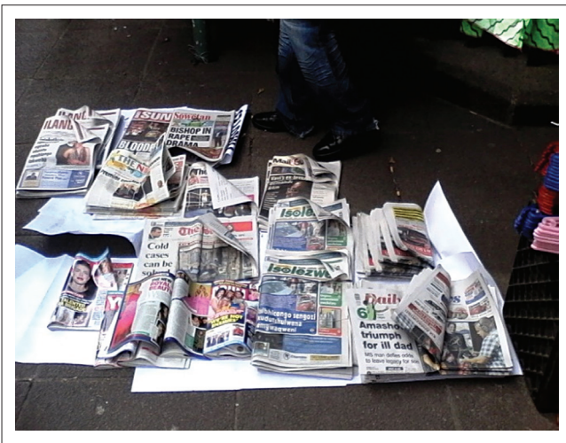
FIGURE 3: Newspaper selling site on a rainy day.