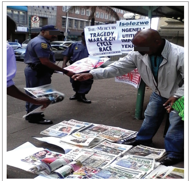
FIGURE 1: Working environment.